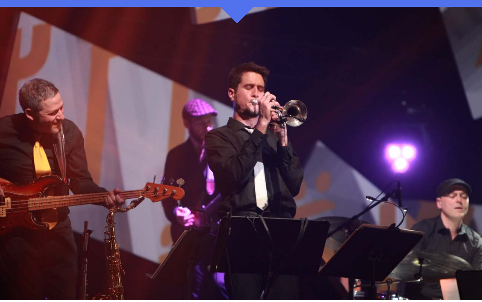
La Soirée des Éloizes 2016 in Dieppe. Les Païens, house band.